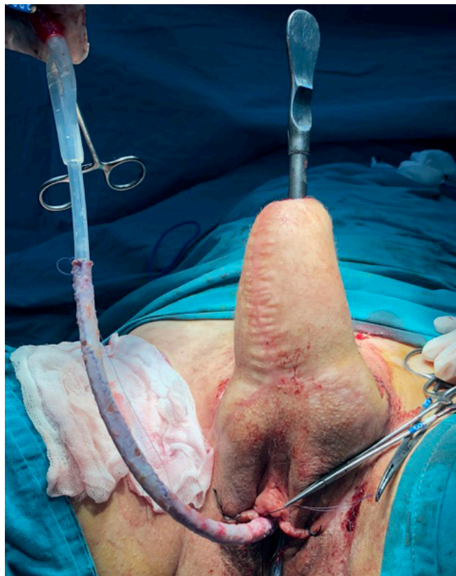
FIGURE 5. Tubularization of the graft on the 18ch Foley catheter.