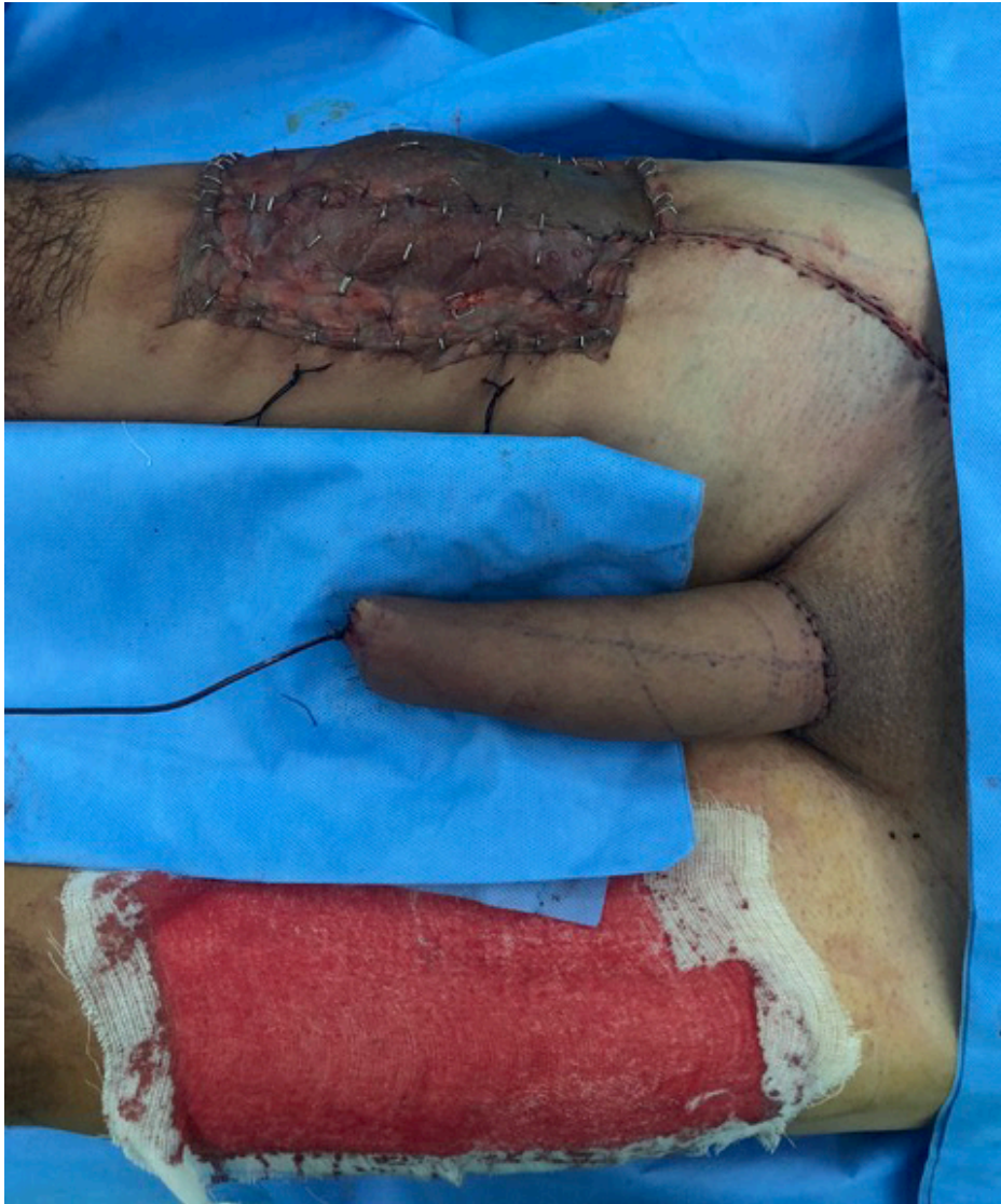
FIGURE 3. Fixation the thigh flap in the shape of “tube in tube” to the recipient area.