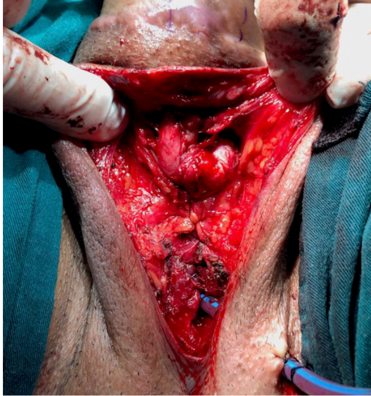
FIGURE 6. Fixation of the clitoral hood onto the neourethral anastomosis.